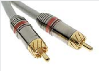
3-1: A composite video cable looks just like an audio cable. However, both the cable itself and the connector are optimized for video.