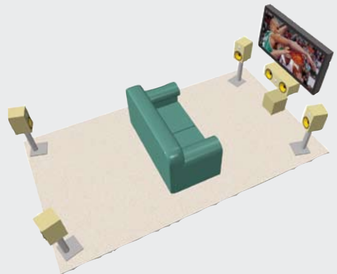
4-3: This is ideal but not always possible.

The Center Channel speaker (C from now on) should be as close to your TV screen as possible – either directly under or directly over it – and at the same distance from your favorite chair as the main speakers.