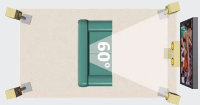
4-2: If you're a music aficionado, consider moving your main speakers further away from the video display.