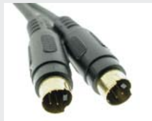
3-2: A single S-Video cable is actually several cables in one. That's because the S-Video format separates brightness and color information before sending it through a multi-conductor cable.