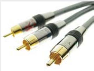
3-3: You'll need three separate signal paths to get one component video signal from your DVD player, for example, to your monitor.