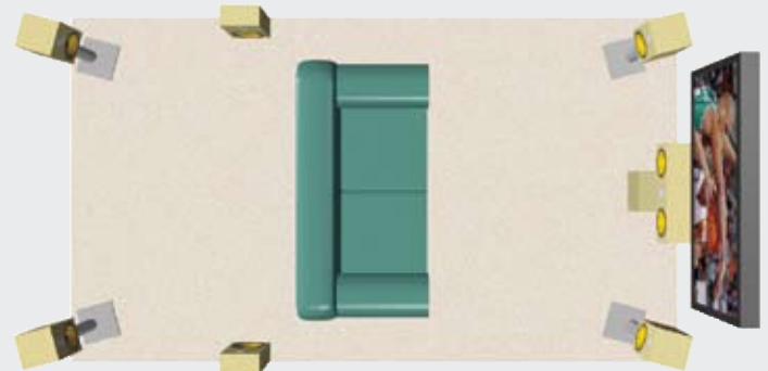
4-7: A "6.1/7.1" system adds speakers at the rear of your home theater room to reproduce "Center Surround" information contained in whatever source you are playing.