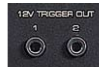
12v out jacks

Remote Control: Consider how you're going to "talk" to the processor. Will you use a hand-held remote controller?