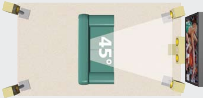
4-1: This is the best "movie" angle as it duplicates the speaker placement on a "dubbing stage" where movie soundtracks are mixed.