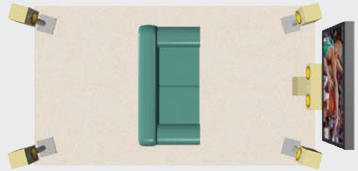
4-5: Directional Surround speakers let you pinpoint the apparent origin of sounds. This particular set-up is optimized for music enjoyment.