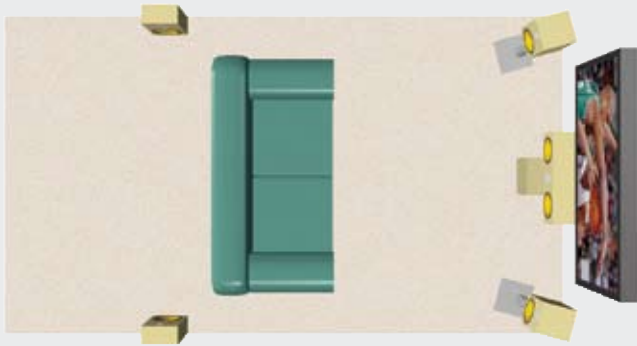
4-4: If you'll be listening primarily to movie soundtracks, place your surround speakers on the side walls just behind your main listening/viewing position.