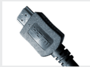
3-4: A single HDMI cable can replace up to eleven separate conventional cables!